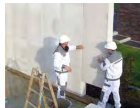
Vertical panels are highly suitable for fast building of standardized homes.

Horizontal panels for industrial and commercial buildings where good in-house climate and fire protection are a must.