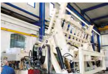
Decentralized control integrated in each single machine.

Experience has shown, that even in a well-organized AAC plant, a savings potential of more than 50,000 per year is possible after a data analysis.