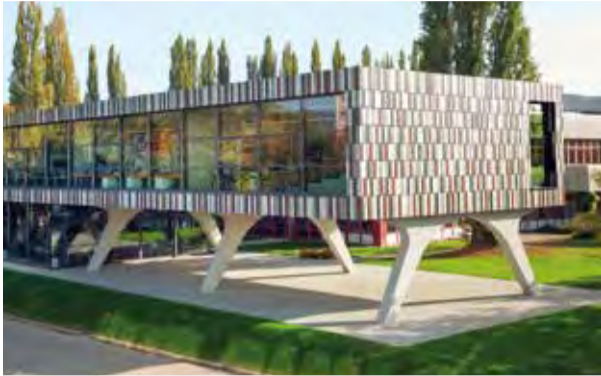
Fibre cement facades: beautiful and long lasting.

Few building materials offer a combination of architectural scope and strong technical specification as convincing as fibre cement cladding and roofing.