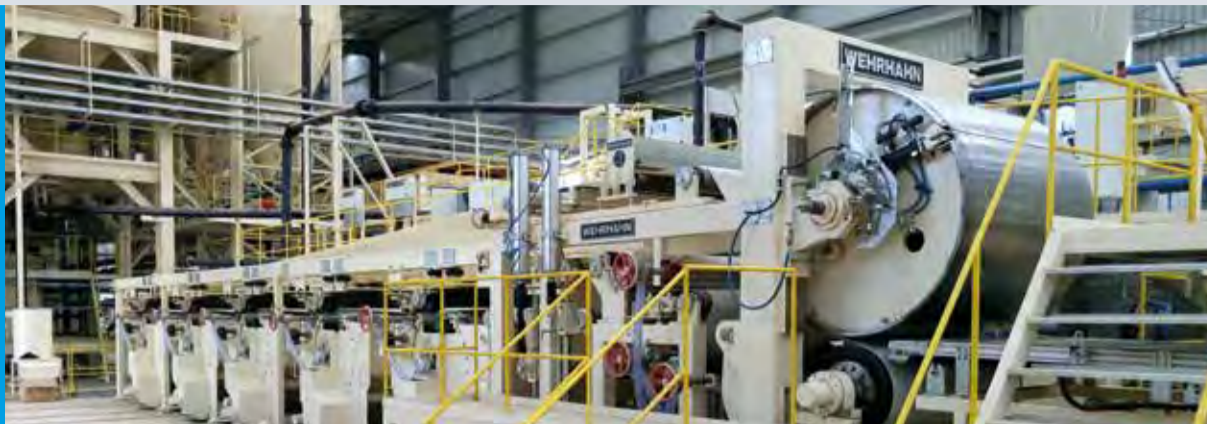
“All new” 5-vat high performance sheeting machine.