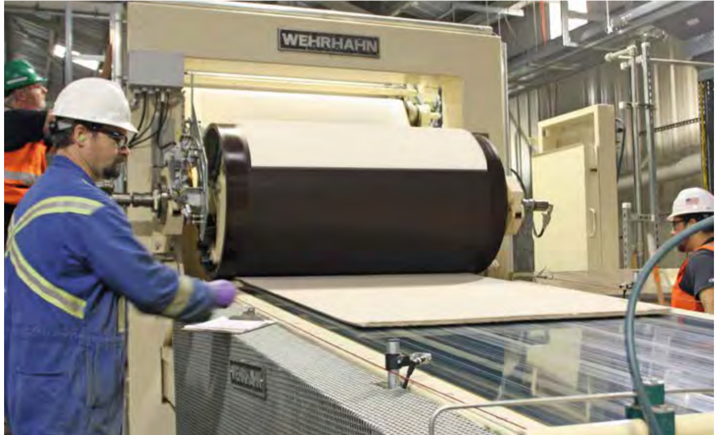
Fast responding sheet thickness control system.

Wehrhahn uses mathematical modelling of the involved process components and software controllers. Based on mass balances, this method can describe the entire process of slurry feeding, mixing, vat feeding and layer generation up to the forming roller. PI-controller models can link the layer thickness signal with the slurry feeding characteristics and the felt speed. The resulting set of equations image the complete control path and the thickness control system.