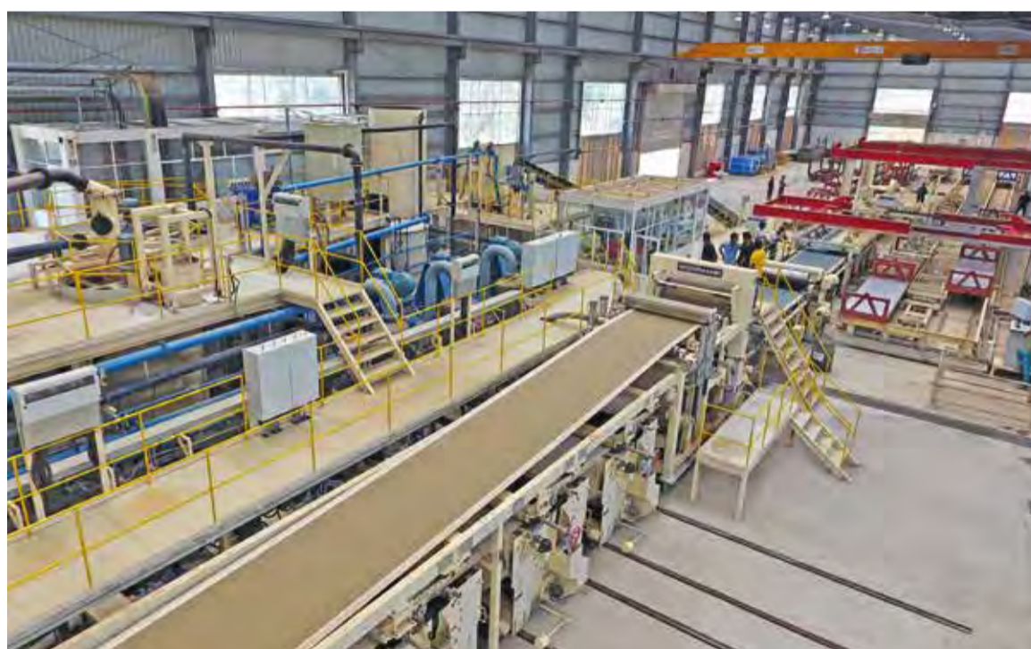
Feasible production of high quality fibre cement sheets in Sri Lanka.