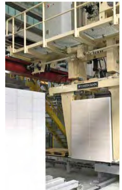
Tailor made unloading and packing solution for Xella.

The Xella Group is in a stable market position – the continuous growth of the German construction industry also presents challenges for production. Driven by the market, Xella wants to increase its production volume, so the production process has been reconsidered.