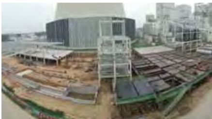
Jing Neng Power – superSMART – just about to come.

The capacity of all AAC plants exceeds 200million m 3 /year.