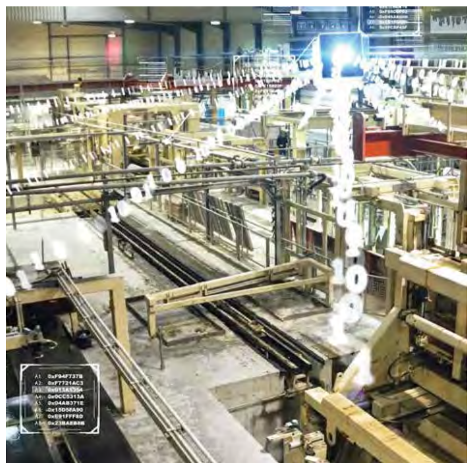
The new feature of Wehrhahn energy management system is called “Load Peak Monitoring System”.

The “Load Peak Monitoring System” of the Wehrhahn energy management system WH-EnMS takes care of it. The system continuously measures the power requirement, calculates the presumed peak power of the next 15 minutes and shuts down previously defined unnecessary consumers, like air condition, heater or air compressors if they are not needed. WH-EnMS does not only consider consumers in the production plant, but also in administration buildings, workshops, outdoor areas, air conditioning or heating systems. Often only a short-term shutdown of a few minutes is necessary to guarantee the determined maximum power peak.