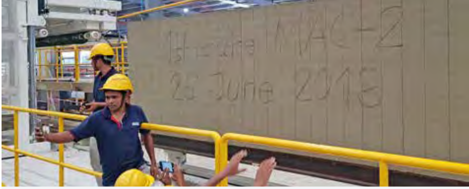
The Malaysian AAC producer Stärken belongs to the Chin Hin Group, which is the largest building materials distributor in Malaysia.

The Stärken AAC factory in Serendah, Selangor, produces high end AAC quality products and has already reached the maximum production plant capacity of 1,250 m 3 /day.