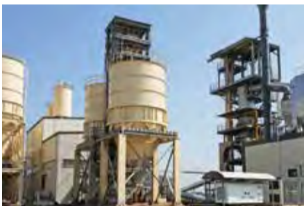
Lime production and mortar production just about to start operation.